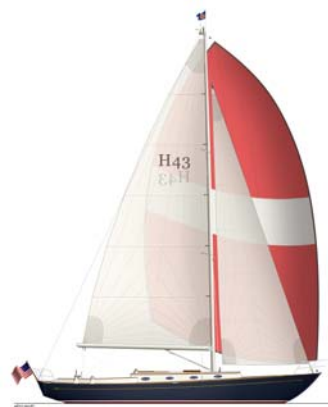
The Return of a Yachting Legend