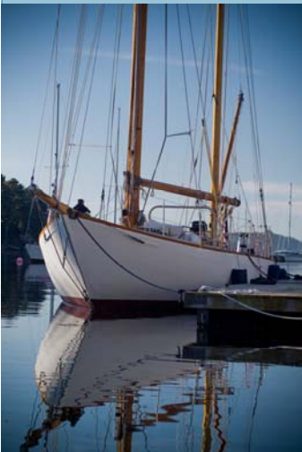
Rugosa 1926 Herreshoff NY40