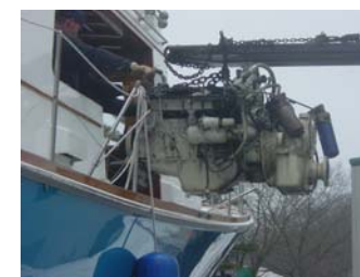
650HP Engine Leaving Amy B , a Jarvis Newman 46