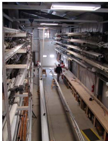
New Rigging Shop

Greater efficiency means less wasted time and lower costs to both you and GIBY. Our new parts room gives the crew faster access to their supplies. Underground telephone and data lines have been installed to improve the flow of communication across our seven acre site. Travel time between buildings has been reduced by installing two new heads, located closer to the work areas, and a second Carpentry Shop to serve projects on the north end of the site.