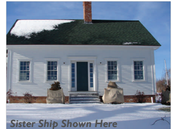
Sister Ship Shown Here