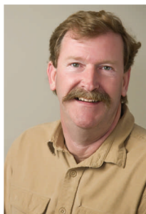
Steve Chase Carpentry