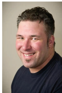
Mickey Polakowski Systems