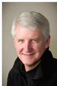
Butch Dismukes Parts