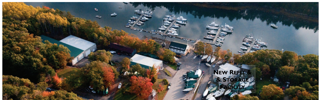
NEW REFIT & STORAGE FACILITY