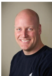
Steve Dee Mechanical Systems