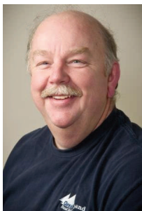
Mark Salmons Carpentry