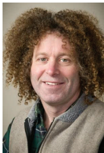
Michael Hogan Refinishing